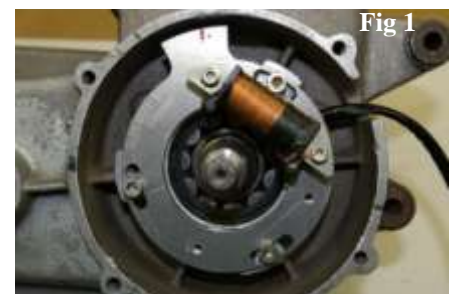
Picture shows ignition only stator, however the position of the lighting stator will be the same

If a dial guage is not available the degree marks on the rotor can be used. With a piece of wire bolted on the crank-case set piston to TDC and align wire end with the 'T' mark, rotate the rotor to 21°.