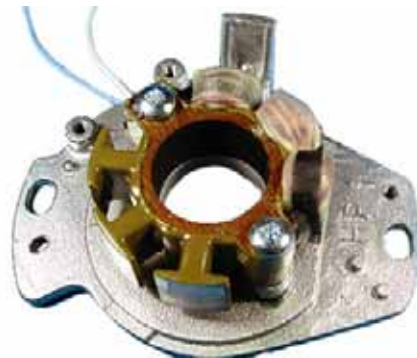
C23 - Ignition coil with base plate