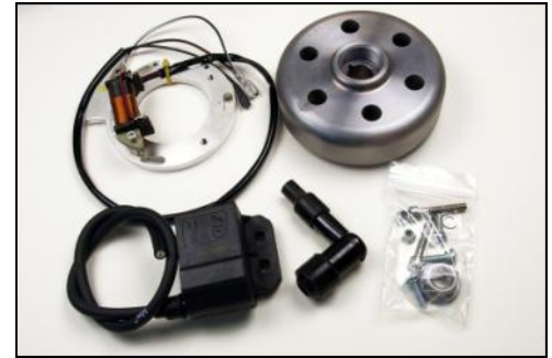
Ignition only shown, lighting kit is also available