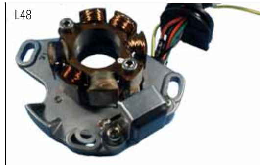
Plate shown as a guide (not included in stator kit)